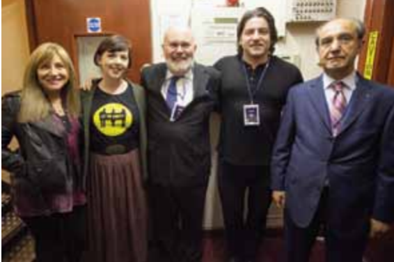
David Norris, the Palestinian Ambassador and Friends at the Gig for Gaza Event in the Olympia Theatre, September 2014